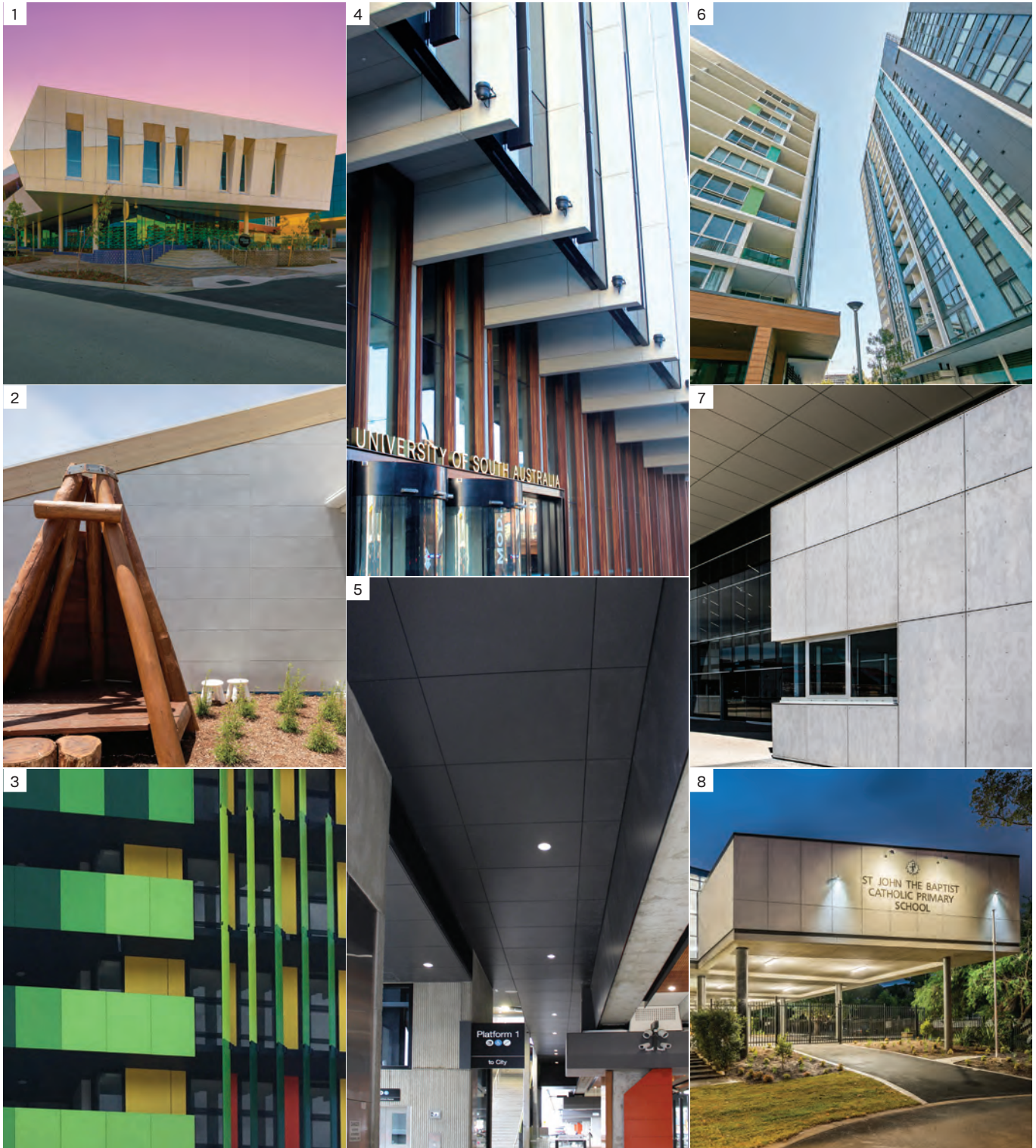
1 Casey Hospital, VIC 2 Maragon Early Learning Centre Wellard, WA 3 Commonwealth Games Village, QLD 4 University of South Australia, SA 5 Rosanna Train Station, VIC 6 Wollie Creek Apartments, NSW 7 Emmanuel College, VIC 8 St John The Baptist Catholic Primary School, NSW

Cemintel fibre cement products have been specified, approved and installed in thousands of square metres of high quality Australian construction projects. Here is a selection of projects showing the diversity of the material in various building types and some of the options of different surface finishes that are suitable for recladding projects.